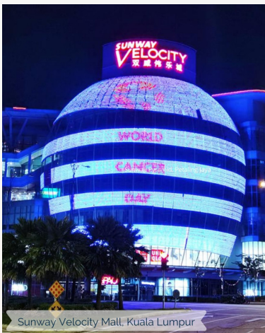
Sunway Velocity Mall, Kuala Lumpur

Inspired by the saying, 'Through the darkness of night, the light will lead the way', some of the historical sites and buildings in Malaysia were lighted up on the 4th February 2021 to highlight the issue of cancer control. Undoubtedly this act has emphasized the strong hope, faith and willingness one conveys to those battling cancer.