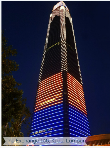
The Exchange 106, Kuala Lumpur