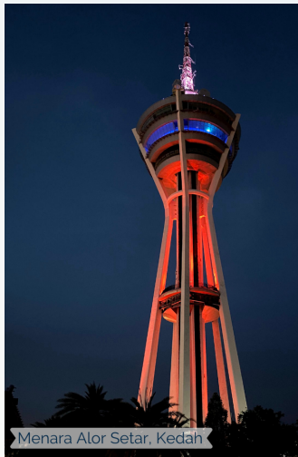
Menara Alor Setar, Kedah