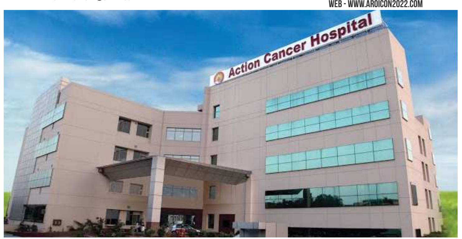
ACTION CANCER HOSPITAL, PASCHIM VIHAR, NEW DELHI